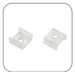
Mounting Clip (PC)